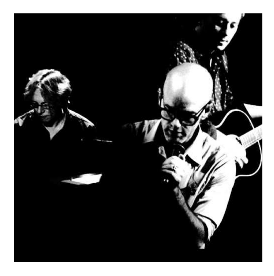
R.E.M. Reached #4 with "Losing My Religion" in 1991.

These guys were one of the first alternative bands to really have monster success. No, they were not a hits machine, but that wasn't what they were aiming for. "Everybody Hurts" (#29) was a very special tune for a lot of folks, and "Shiny Happy People" (#10) always made me feel tremendously happy. Their music conjured up the feel of the sixties, but they also explored new frontiers with their jangly guitars and folkish vocals. Most importantly, R.E.M. was ALWAYS cool. Unfortunately for their many loyal fans, on September 21, 2011, the band announced they were calling it quits. The flags were flying half-mast in Athens, Georgia that day. On a personal level, I'll always love them for having the gonads to take a stand on various social and political issues. R.E.M. was a citizen of the world and they were unafraid.