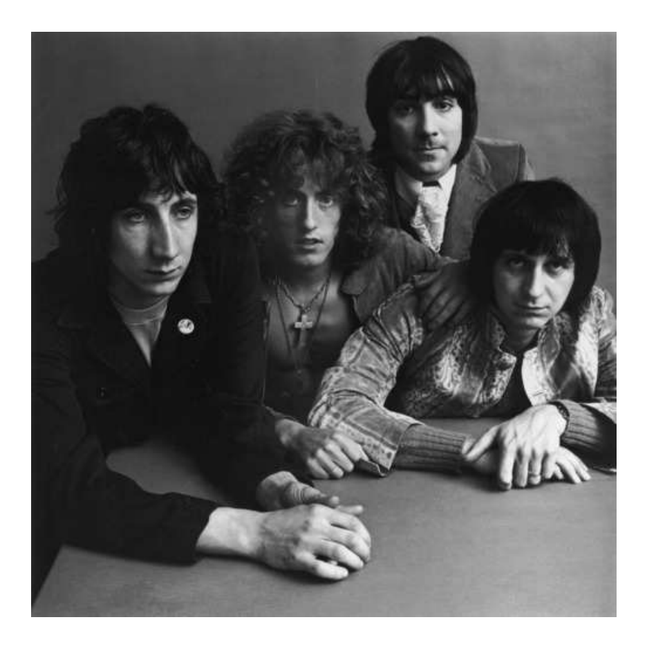
The Who Reached #9 with "I Can See for Miles" in 1967.

I've always loved The Who. They were smart, they were loud, they rocked HARD, they created mayhem, and they were pissed off; even to the point of destroying their instruments onstage. One of the truly great bands in history, The Who brought loud, youthful aggression, monster power chords and exquisite, literate songwriting into play and produced a mountain of great songs. But they never had a number one record. Dammit, there must be a mistake! Just look at the hits! "I Can't Explain" (#93), "My Generation" (#74), "Happy Jack" (#24), "Pinball Wizard" (#19), "Won't Get Fooled Again" (#15), "Who Are You" (#14)...the list is almost endless. Their Marshall stacks, large PA systems, use of synthesizer, their own aggressive playing styles, and their development of the rock opera were all huge contributions to rock music. So, are they still pissed off? Probably not, but their lyric,