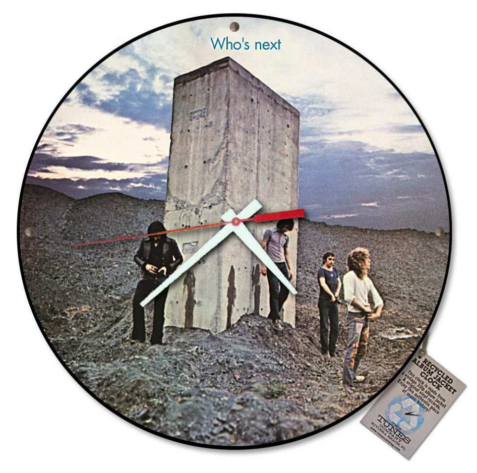
Click Here To See The Tunes Company Offering For The Who

Listen: <a href="https://www.youtube.com/watch?v=62ZJn0cTASo">https://www.youtube.com/watch?v=62ZJn0cTASo</a>