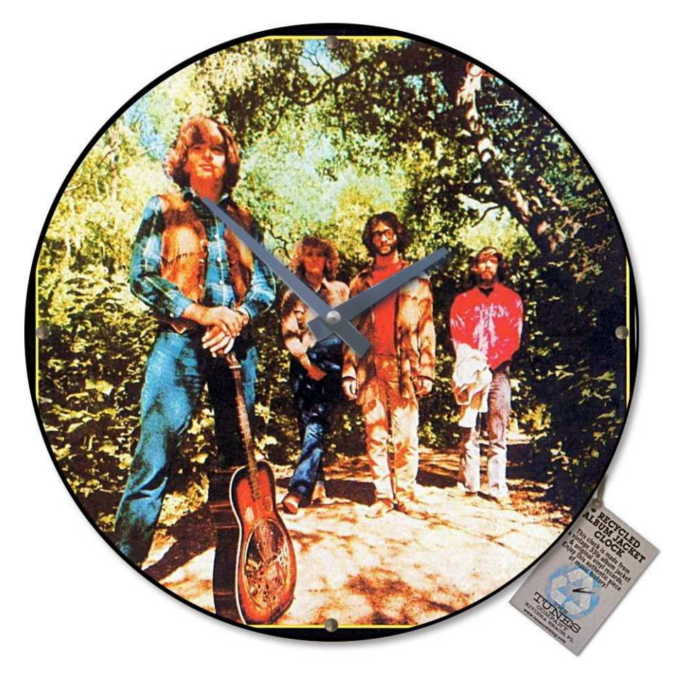
Click Here To See The Tunes Company Offering For Creedence Clearwater Revival